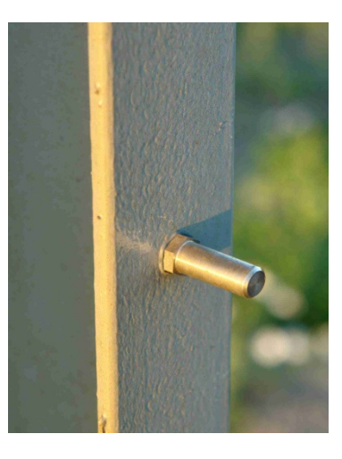
Fig. 1. Track axis reference point and at the same time railway geodetic network point fixed to a traction current pylon