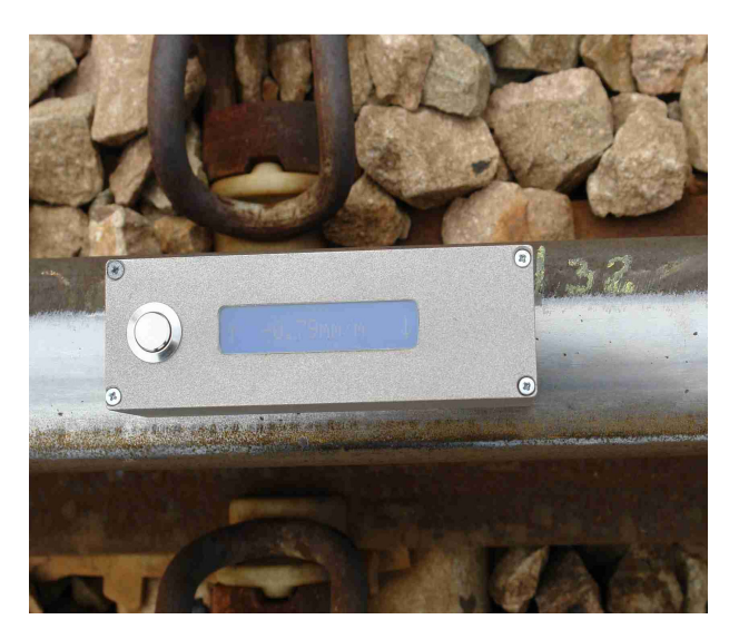
Fig. 2. Electronic level during the field tests