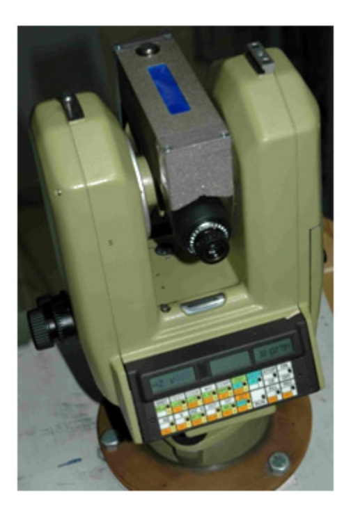
Fig. 3. Electronic level with electronic total station Leica TC2002 during testing in geodetic metrology laboratory of AGH University of Science and Technology

With the full range of work of the level (-10 \div +10 \text{ mm/m}) the differences between the indications of these two devices reach 0.31 mm/m. The values of the differences in readings from both devices enabled the calculation of the calibration corrections for the controlled level. Once they are included in the results, we can conclude that the accuracy of the clinometer is no worse than 0.1 mm/m.